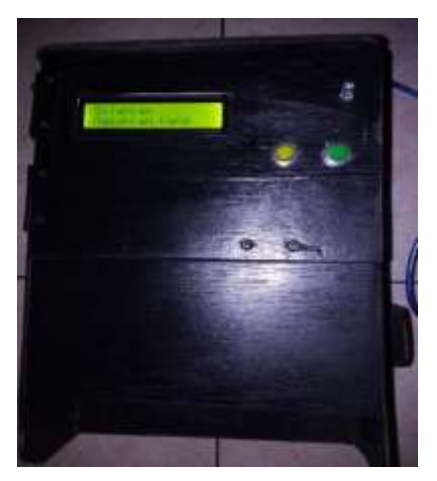
Figure 1.5 Initial display before money is detected

1. The tool tester is in the initial display state when the purchase money is detected