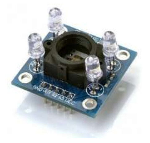
Figure 1.3 Color Sensor (Aidil, 2016)

The data collection distance must be 2 cm from the sensor. white color calibration using white HVS paper (Aidil, 2016).