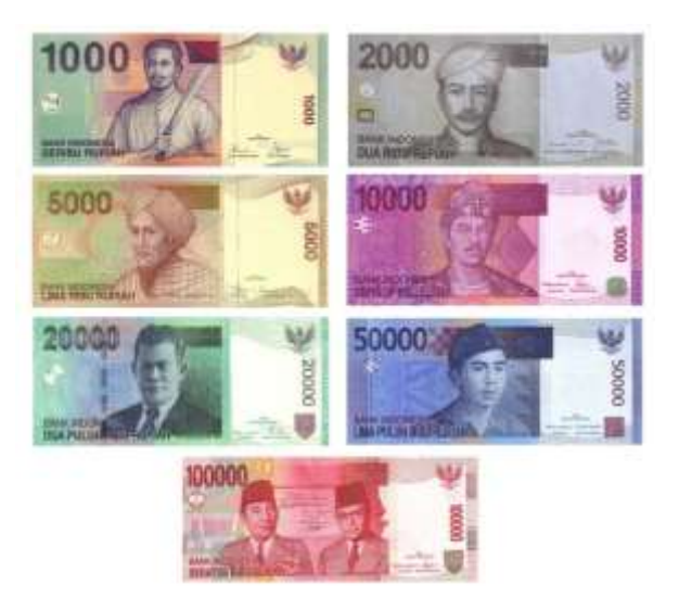
Figure 1.1 Rupiah Banknotes