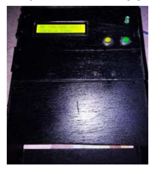
Figure 1.6 Display of genuine IDR 100,000 currency detection

1. Testing of nominal detection equipment and authenticity of real IDR 100,000 money