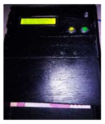
Figure 1.7 Display of fake IDR 100,000 note

2. Testing of counterfeit Rp. 100,000 nominal and currency detection equipment