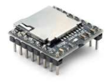
Figure 1.4 DFPlayer (Adi, 2013).