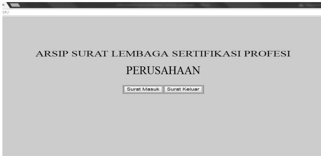
Figure 1: Display Main Menus

The survey included questions regarding user satisfaction with phpMyAdmin. Respondents rated their satisfaction on a scale from 1 (very dissatisfied) to 5 (very satisfied).